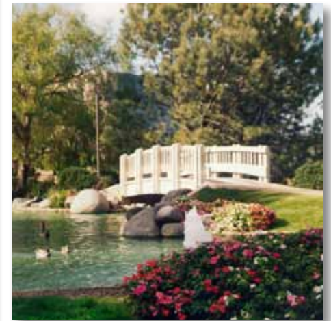
Torrey Pines Science Park