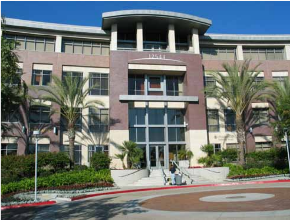
Plaza Del Mar