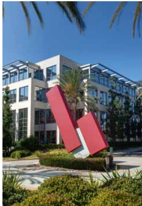
Sunroad Eastgate Mall