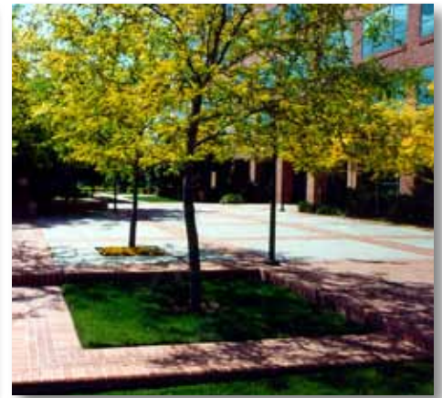
Governor Business Park